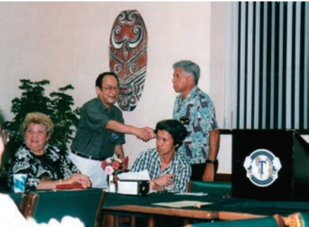
2nd Joint Meeting for Japan and Hawaii TMCs held in Honolulu, Oct. 31st, 1998