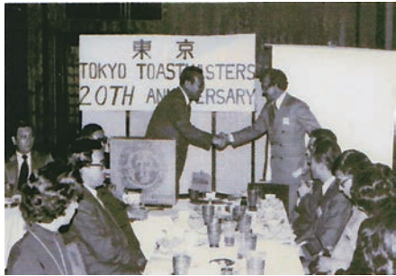
Tokyo Toastmasters Club 20th Anniversary, 1974