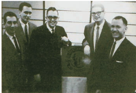
Tokyo TMC, Old Time Toastmasters, 1960s

Finally, Japan Toastmasters Council was established in April, 1986 with the above 14 clubs except for Hiroshima TMC by DTM Toru Mori.