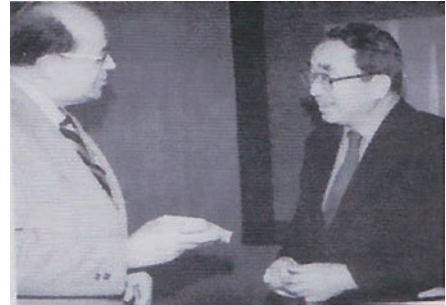
Tokyo TMC, VIP Guest Economic Minister, H.E. Nobuhiko Ushiba, Feb. 1977