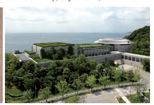
Awaji Yumebutai International Conference Center