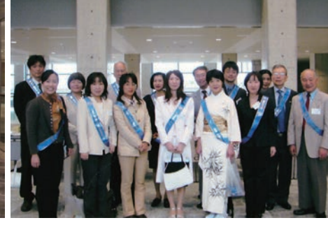
Members of the hostina clubs